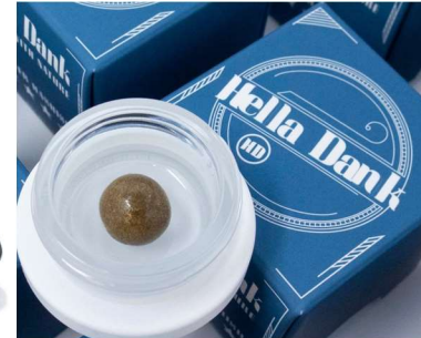
5 Star Hashish