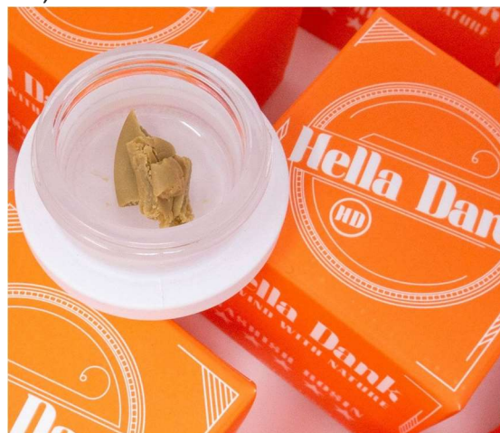
5 Star Hashish Rosin