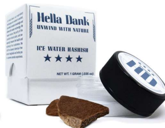
4 Star Pressed Slab