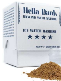
4 Star Pressed & Sieved